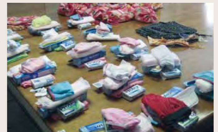
Care packs help survivors get by.

To move ahead, GRIP would like to acquire greater commitment from government. For instance in cases where there is a piece of legislation that makes it difficult to implement the programme, they would like to see government work towards improving the implementation of that particular area of legislation. At the same time if they identify needs, they would like to see greater support in making sure that these are met. For example, if a municipality has a budget to build 100 00 houses, 10 houses could be given to the GRIP shelter for that year. They could also help women through the application process and make sure that they would be able to receive a house from the government. In their future plans they want government to recognize the difference that these programmes have made and that it is cost effective. To then replicate it throughout the country and provide funding for it to be sustained. GRIP provides mandatory statutory services for the government and these services should be 'contracted' out to NGO's, who have the expertise, to provide assistance. *not her/his real name