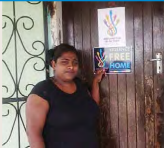
The Prevention in Action programme is encouraging violence free communities.

"Everybody has a role to play. So in the end it's the whole community working together the, young, old, male and female, it's everybody taking charge of the community because there is something everybody can do and this programme helps people to have a role from the beginning."