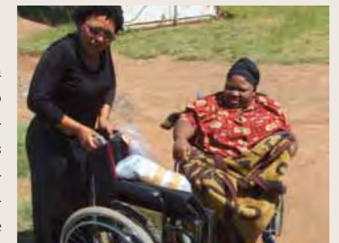
Paralegal of Glencoe with the client she assisted to get a wheelchair