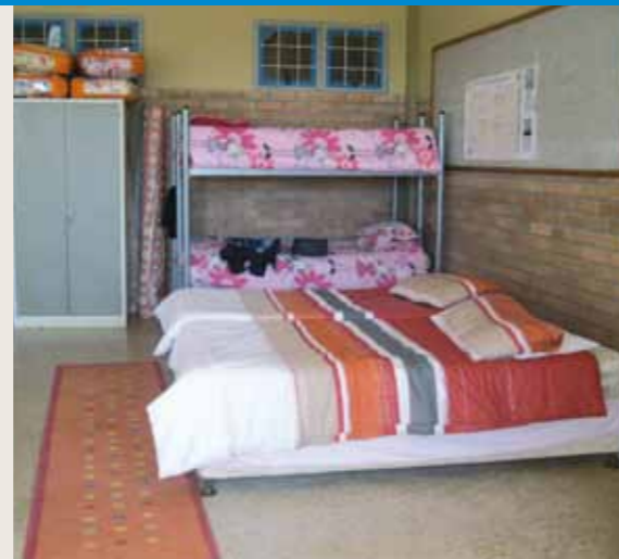
Care rooms provide survivors with a safe and comforting space.