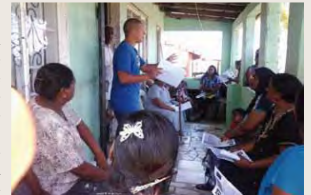
Prevention at home, among friends, family, neighbours.

Ideally, the Western Cape Network on Violence Against Women would like to saturate communities with this prevention training. The more people that know about how to prevent violence against women, the more they will be able to shift negative social norms. This programme is designed in a way that can be driven by communities with less resources, all it needs is people that can influence each other. However, there is some need for funding to be able to deliver training and manage the programmes. Replicating and scaling up such strategies would help communities, and families like Siphoh's to take stock of and address violence against women in their midst.