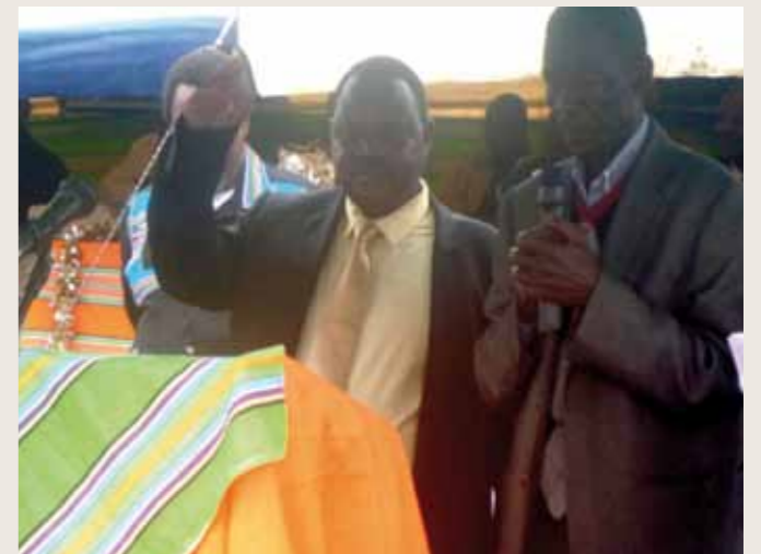
Chief of Mangondi Village, the first citizen of his village to take the public oath taken by men to do all in their power to create Zero Tolerance to any form of Abuse of women and children as well as creating a safer place for women and girls in their communities.

They are starting a new project called a young perpetrators program to address youth specifically; youth is a special group within communities that need to be given specific attention to their issues. They are also looking into research and looking at what are the factors that keep women submissive and non-resistant. So that these cases can be properly processed and that justice gets served, because it is still rape even if the victim becomes submissive to the perpetrator in a situation where they could have found ways of getting out.